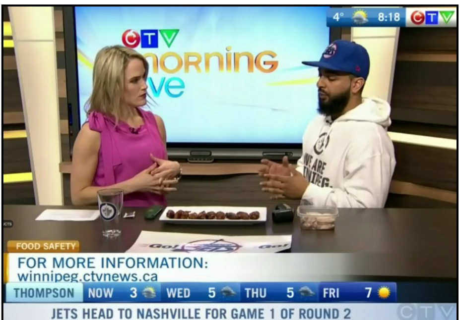
Discussing bbq food safety on the CTV Morning live show during the Winnipeg Jets historic playoff run.