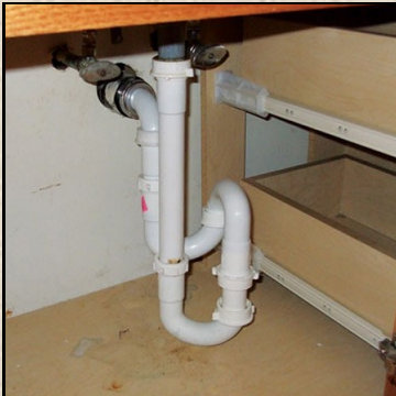
If one elbow is good, why not put two...