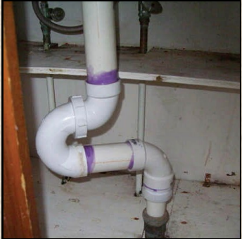
What!!! The trap is there... just turn your head sideways