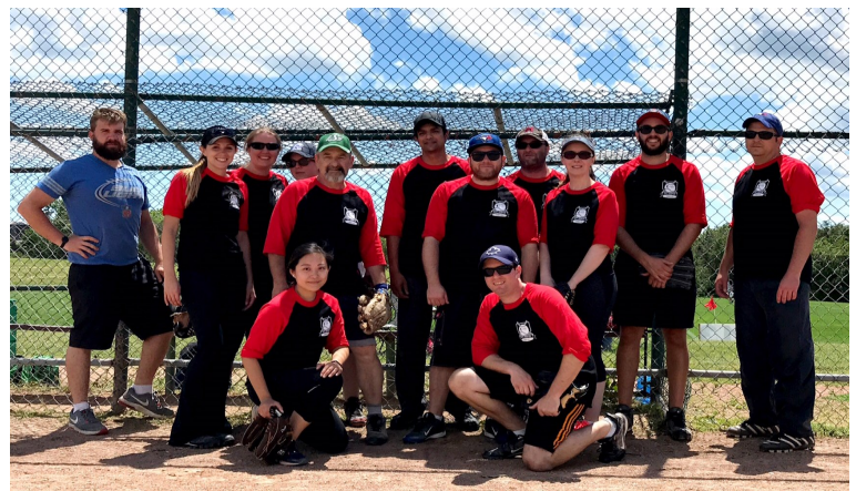
Peel Public Health