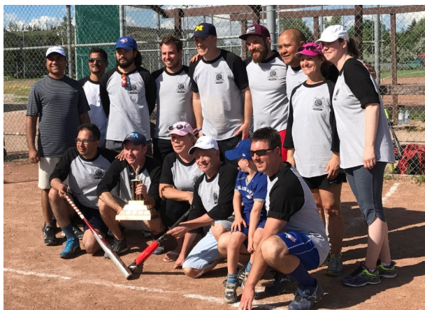
Durham Region Health Department