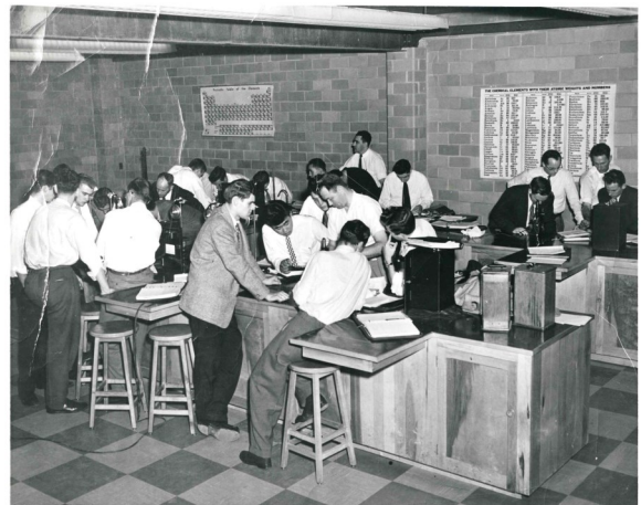
Pictured: Class of 1956, lab work